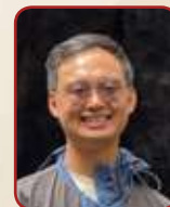
Yong Zong Yao Technology & Optimization