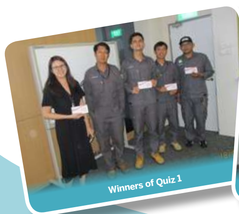
Winners of Quiz 1