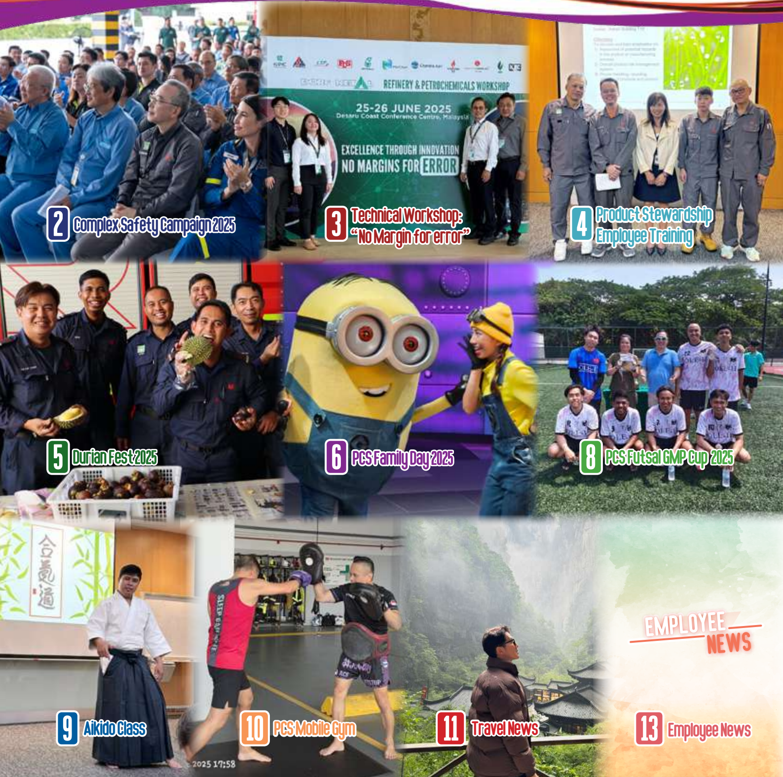
2 Complex Safety Campaign 2025