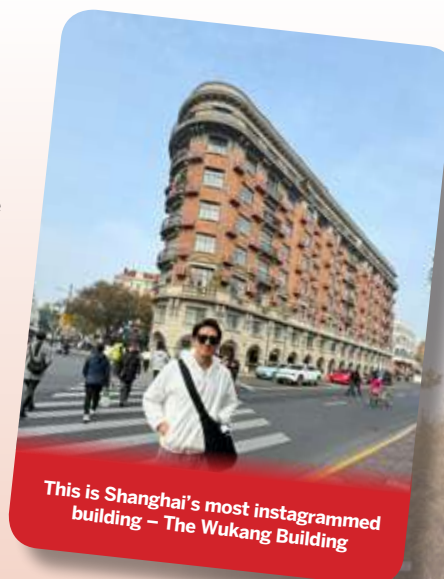
This is Shanghai's most instagrammed building – The Wukang Building

From spicy hotpot and ancient towns to sky-high towers and neon rivers, this trip showed how diverse and exciting China truly is.