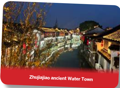
Zhujiajiao ancient Water Town