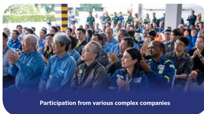
Participation from various complex companies