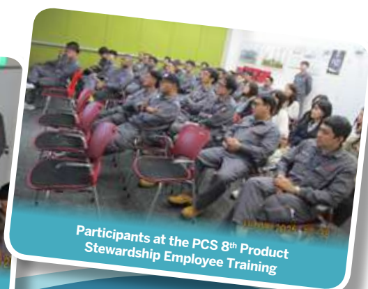
Participants at the PCS 8 th Product Stewardship Employee Training