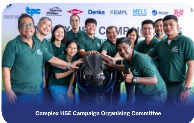
Complex HSE Campaign Organising Committee

Following the official launch, guests participated in a lunch reception and visited interactive exhibits. The event facilitated open conversations around stress management, resilience-building, and creating inclusive, psychologically safe workplaces.