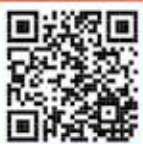
13 Employee News