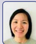
Rina Soh Engineering