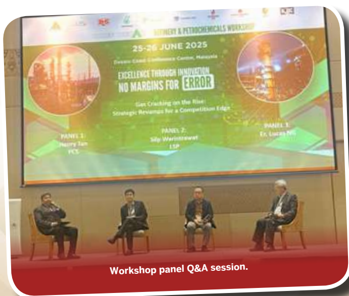
Workshop panel Q&A session.

Through this trip, I have gained valuable insights into the petrochemical industry. I am sincerely grateful to the management for providing me with the opportunity to broaden my perspective beyond our daily operations.