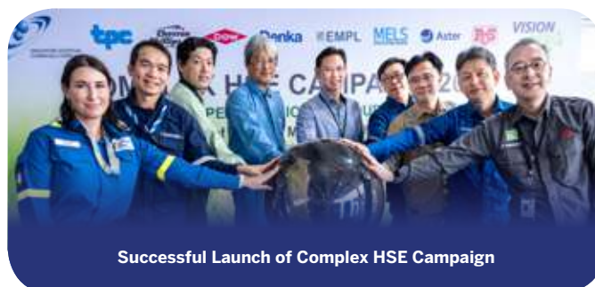
Successful Launch of Complex HSE Campaign