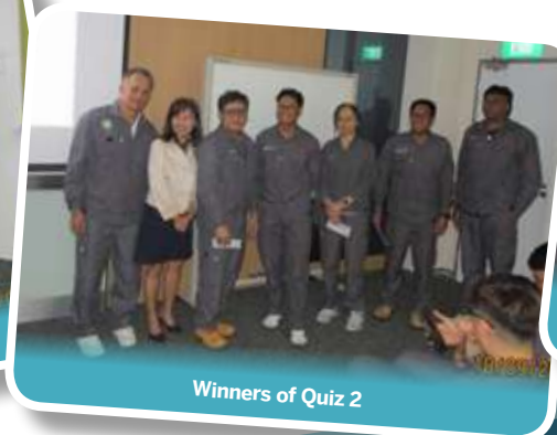
Winners of Quiz 2