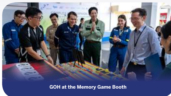
GOH at the Memory Game Booth