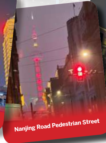
Nanjing Road Pedestrian Street