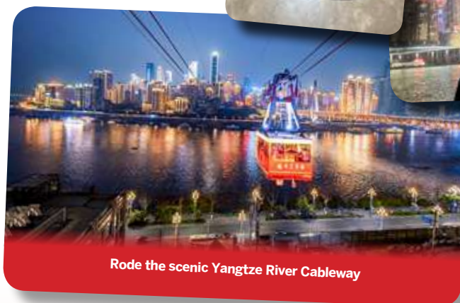
Rode the scenic Yangtze River Cableway