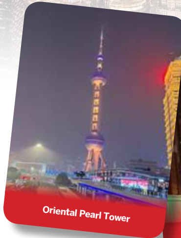
Oriental Pearl Tower

The Oriental Pearl Tower is the renowned landmark in Shanghai. Standing tall on the banks of the Huangpu River, its unique architecture and tower height offered panoramic views of the city's stunning skyline, including the Bund's historical buildings and Lujiazui's modern high-rises.