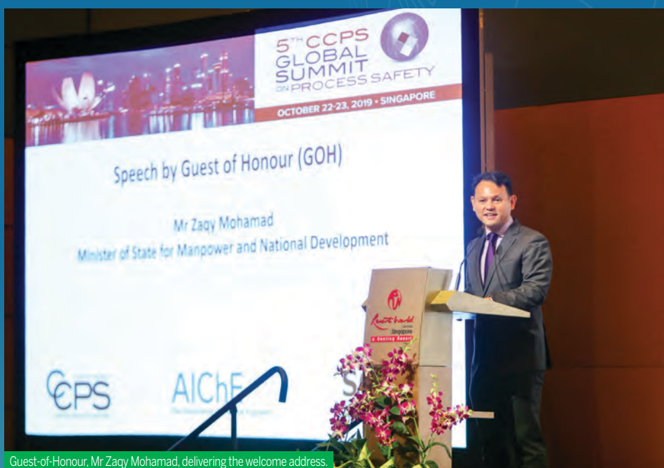
Guest-of-Honour, Mr Zaqy Mohamad, delivering the welcome address.