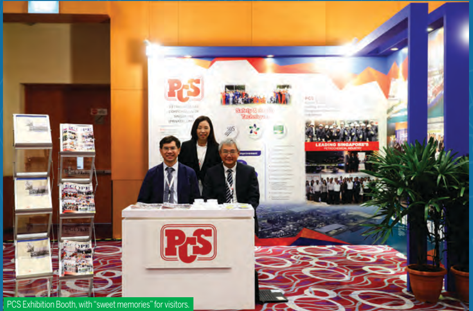
PCS Exhibition Booth, with "sweet memories" for visitors.

Sponsor, and also as the main driver in the CCPS-SCIC Memorandum of Understanding collaboration and partnership. The hosting, logistical